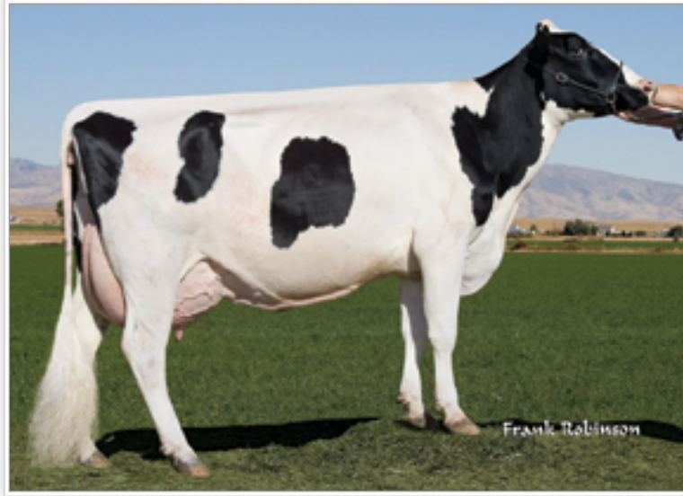
Snake River Rolex 4998-Grade